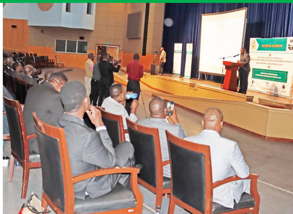
Minister of Agriculture Hon. Sam Kawale making his remarks during the launch of the new policies