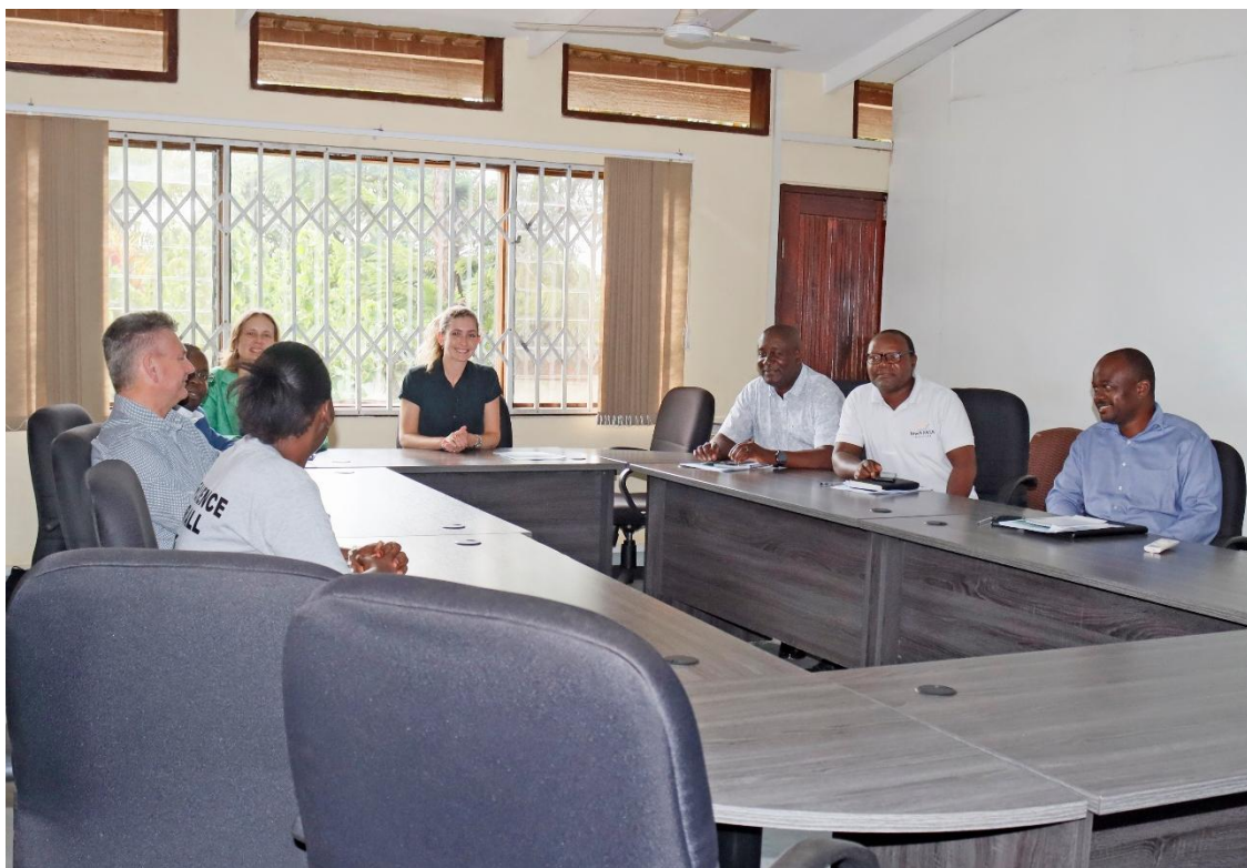
Representatives from MwAPATA and WRT having discussions during the meeting

The two members of MwAPATA staff who participated in the workshop will continue to put such leadership skills into practice during and even after the implementation of the TI project. The training workshop was held in Lilongwe at Kumbali Lodge.