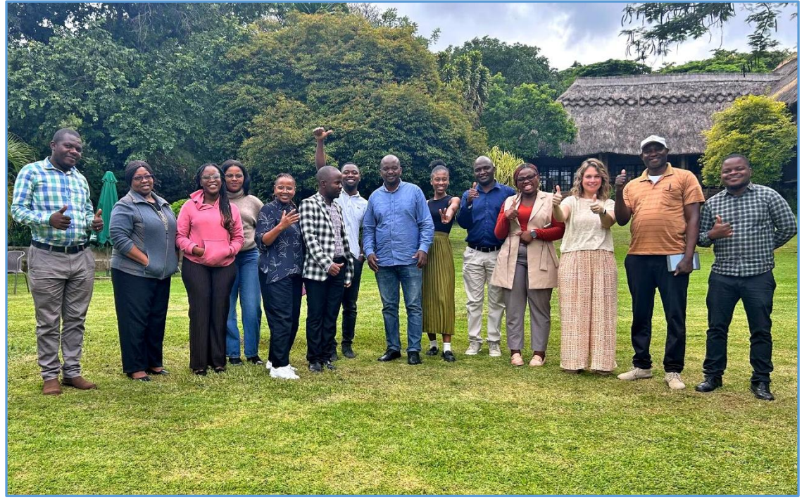
Participants at the training pausing for a group photo on the last day of the workshop

GIZ Malawi in partnership with the MwAPATA Institute, Civil Society Organization Nutrition Alliance (CSONA) and Civil Society Agriculture Network (CISANET), is implementing the Transformation Initiative for Food Systems (TI) project. As part of capacity building for the project team, GIZ organized training on Transformative Leadership in Food Systems Programming, which is facilitated by Korumo Consultants. The training started in October 2024 and has been conducted in phases, which include individual coaching sessions.