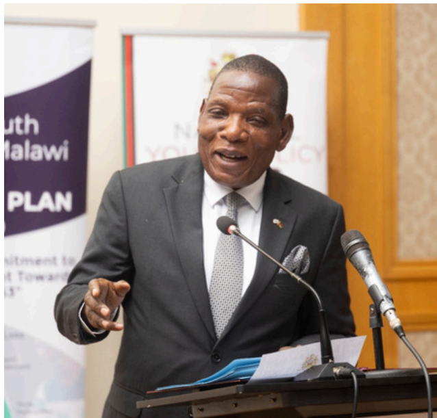
Hon. Joseph Mwanamvekha speaking during the Ministerial Youth Pre-Budget Consultation Workshop

The "Enhancing Inclusive Youth-Led Platform for Evidence-based Agricultural Policymaking and Implementation in Malawi" (LEAP4YOUTH Project), implemented by the Mwapata Institute in partnership with the National Youth Council of Malawi (NYCOM), with funding from AGRA, supported the Ministry of Finance, Economic Planning and Decentralisation in organising the Ministerial Youth Pre-Budget Consultation for the 2026 - 2027 National Budget. The event was held at BICC in Lilongwe on 19th January 2026. The consultation was facilitated by the responsible Minister, Hon. Joseph Mwanamvekha, MP.