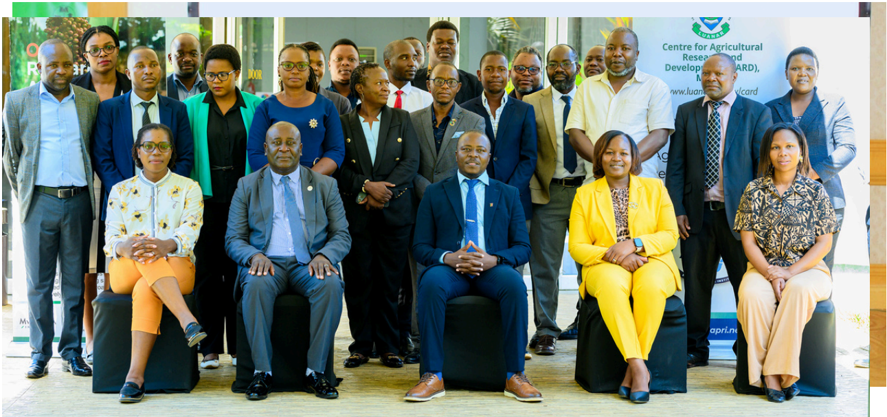
Group photo of the participants at the Policy Dialogue on Agricultural Trade Restrictions in Malawi

On 21st April 2026, the Mwapata Institute convened a Rapid Evidence and Policy Dialogue on Agricultural Trade Restrictions in Malawi. The dialogue, held at Sunbird Capital Hotel in Lilongwe, was organised in collaboration with the Lilongwe University of Agriculture and Natural Resources (LUANAR) and supported by the Africa Network of Agricultural Policy Research Institutes (ANAPRI). The event brought together stakeholders in trade and related sectors to discuss, expand the scope, and address the knowledge gaps left by the Mwapata and LUANAR's recent study on the potential impacts of export mandates on Malawi's economy and development trajectory on an "ex-ante" basis. The stakeholders shared more extensive insights required to quantify the impacts of broader trade restrictions beyond those of export mandates. Among other things, most of the participating stakeholders in the dialogue agreed that trade restrictions risk undermining long-term agricultural growth in Malawi. The participants called for more predictable, rules-based trade policies supported by targeted safety nets and strategic grain reserves to balance food security concerns with stable and competitive agricultural markets.