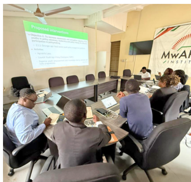
NYCOM and Mwapata teams during the LEAP4YOUTH Inception meeting

Under the project, Mwapata Institute will lead evidence generation and the development of policy knowledge products, while NYCOM will coordinate youth engagement, advocacy, and capacity-building activities. The project is expected to directly reach 10,000 youths, with at least half of them being young women across priority value chains, including maize, soybean, groundnuts, poultry, horticulture, and beekeeping.